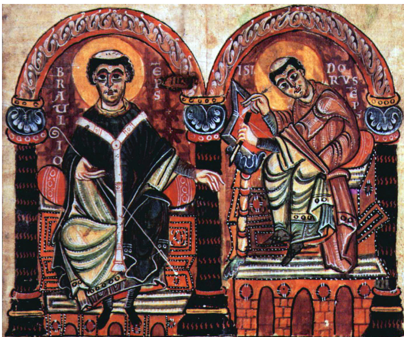
Bishop Braulio de Zaragoza & Isidoro de Sevilla, second half of the 10th Century.

©2009, Revised and expanded June 2020. J.K. Holloway