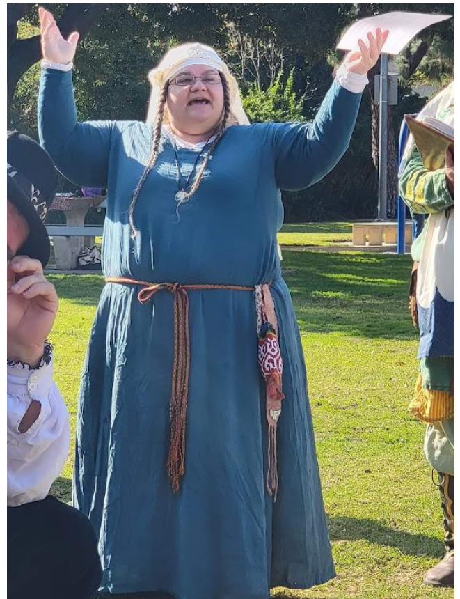
How It's Going: At Lyondemere/Gyldenholt Yule in 2022