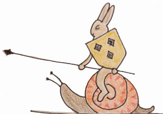
Doodle art by Baroness Arwen Baird, Used with permission

https://www.facebook.com/events/931473141464783/931473164798114/