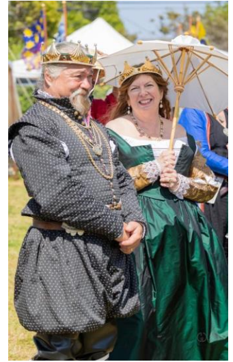
Lyondemere Anniversary 2023