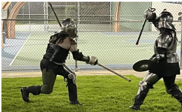
October Fighter Practices in Lyondemere!