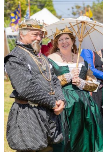
Lyondemere Anniversary 2023

So in your list of resolutions consider what you can do for others in this hobby of ours that can make things run more smoothly for everyone