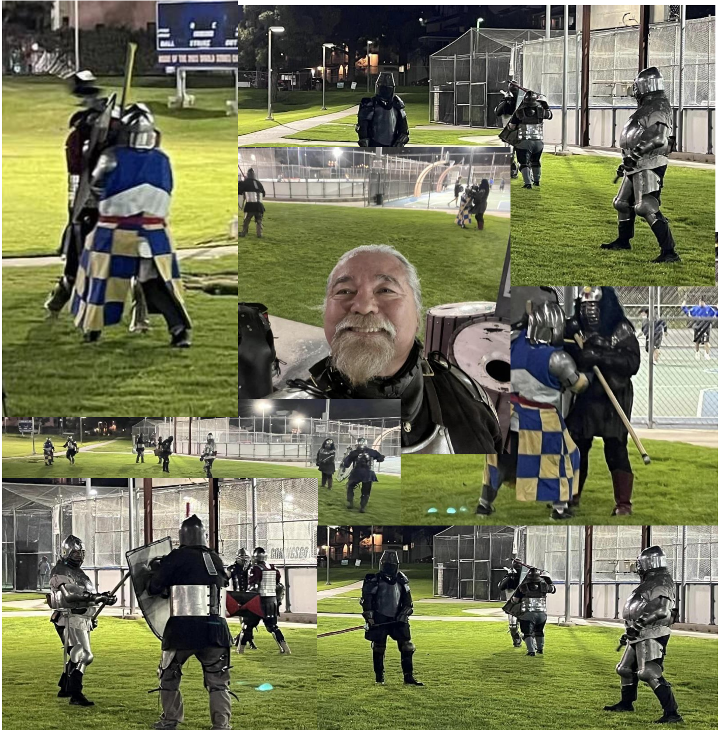
Fighter Practice

Volume 46, Issue 5 ** Anno Societatis LIX (59th year of the Society) ** May 2024 (common era) A monthly newsletter serving the Barony of Lyondemere, Kingdom of Caid [coastal Los Angeles area, CA]