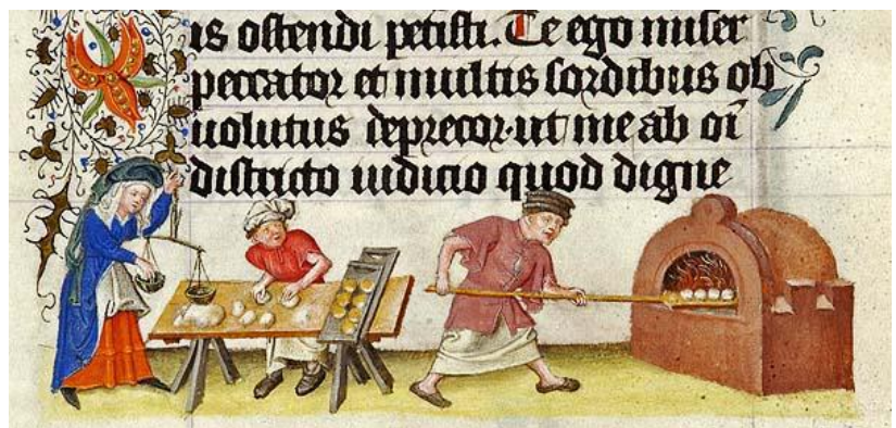
Art from Hours of Catherine of Cleves, ca. 1440. Found in the Index of Medieval Art (#186320)

EVENT OPTIONS: Full weekend stay (in shared cabins with bunk beds, all of which have power outlets) or Saturday day-trip attendance. Full weekend attendance is limited, so register early.